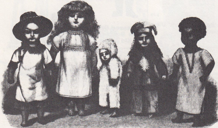
The "Happy Family."